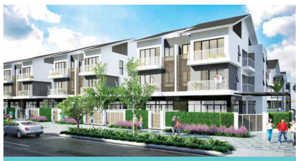
Villa P3-2, a residential complex located outside of Hanoi, features nearly 200 EDGE-certified homes. The project, which uses less glass on the façade, was developed by Nam Cuong Corporation

A study in India found that energy consumption is proportional to glazed area. For each 10 percent increase in glazed area, energy consumption for an office in a subtropical city like Delhi increases by 15 percent for clear glass and by 2-4 percent for solar control glazing. When the glazed area