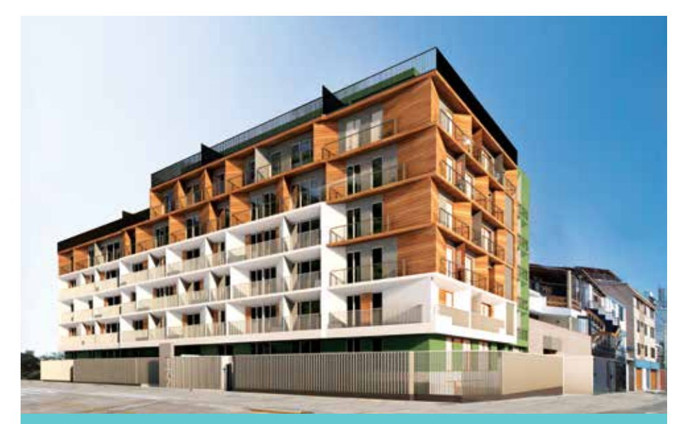
The San Borja district of Lima rewards property developers for EDGEcertified properties such as REBEL with a height bonus incentive. Properties must include green roofs and gardens to complement their resourceefficient design, which often include a reduced window to wall ratio

In the last few decades, architectural language has given